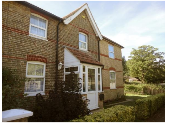
Old Joe's house at 1 East End Terrace now listed as 147 Canterbury Rd The extension came after Joe's time there

Original photo of Old Joe used to make the portrait